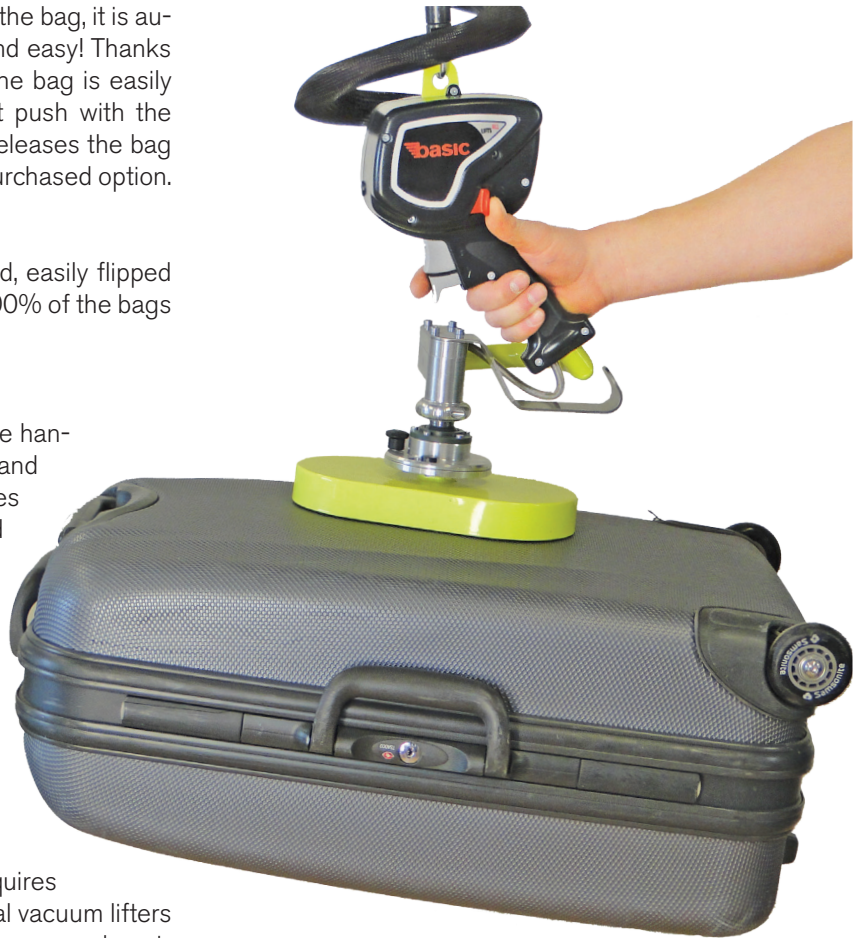
Basic lifts hard bags...

Basic is pneumatically driven and only requires a few per cent of the energy that traditional vacuum lifters need. This gives a positive effect on economy and environment, and also makes the lifter silent.