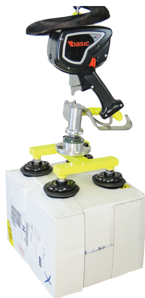
For other types of cargo, such as carton boxes.