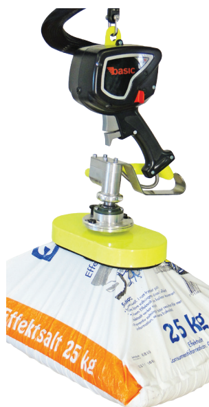
The baggage frame can also be used for sacks.

Basic is multifaceted and can lift just about anything thanks to the hook that always included. The quick connection allows the user to adjust his Basic in just a few seconds to suit different objects sizes and materials, such as sacks or carton boxes. We'll help you to find the application that suits you best!