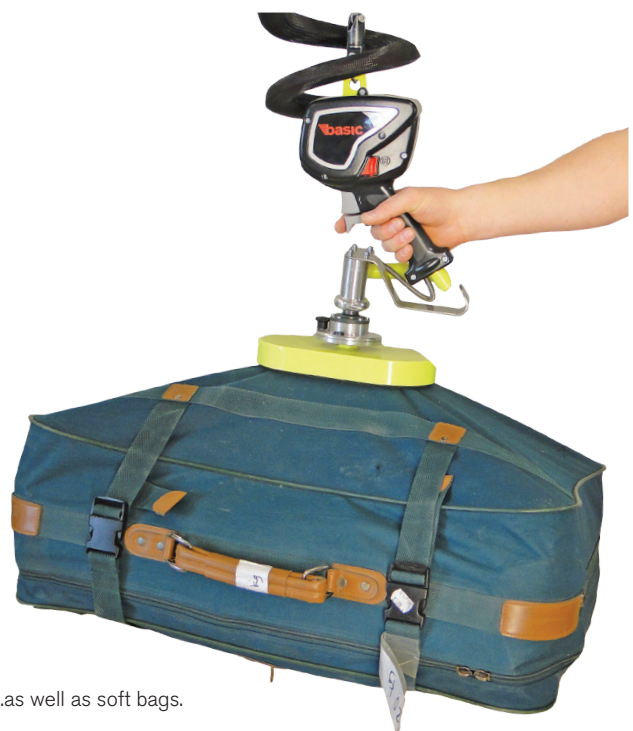
...as well as soft bags.